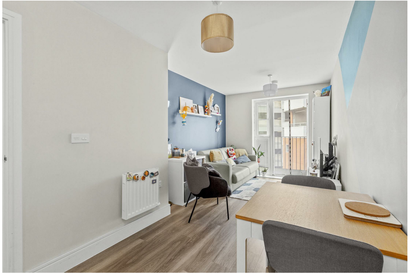
Lilys Walk High Wycombe HP11 2FZ