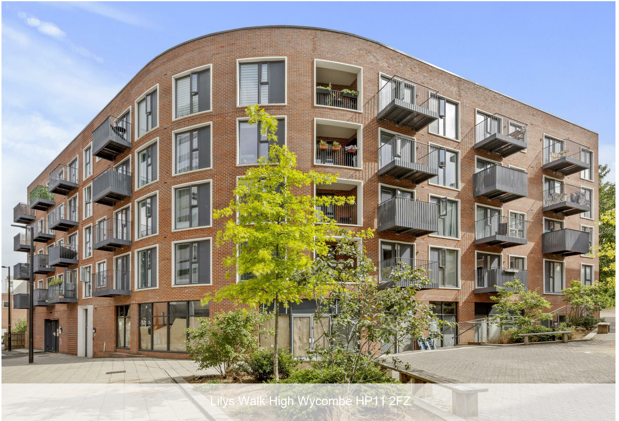
Lilys Walk High Wycombe HP11 2FZ